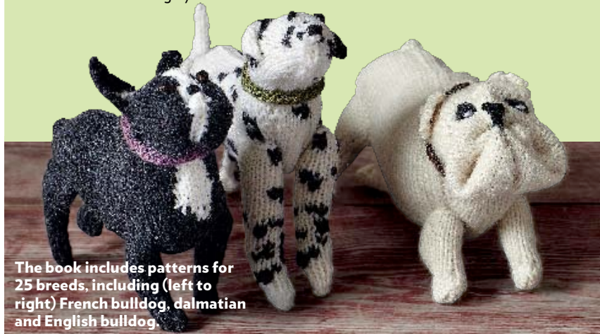
The book includes patterns for 25 breeds, including (left to right) French bulldog, dalmatian and English bulldog.